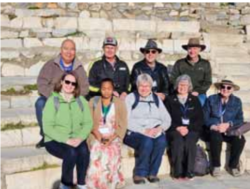
The group in Greece.