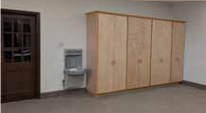
Check out the basement, The new cabinets are in.